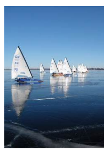
WORLD & NA CHAMPIONSHIP February 2 - 8, 2025 Host: Central Region idniyra.org