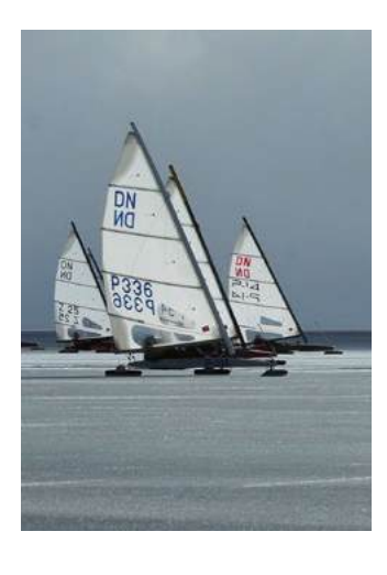
CENTRAL LAKES TBD idniyra.org