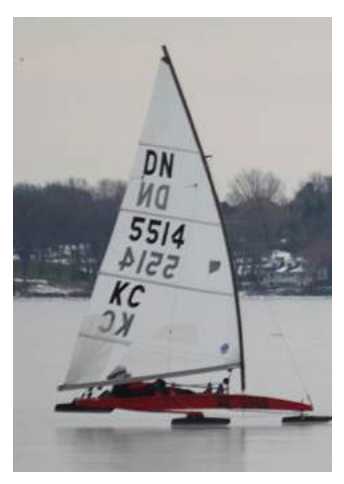
CANADIAN CHAMPIONSHIP TBD idniyra.org