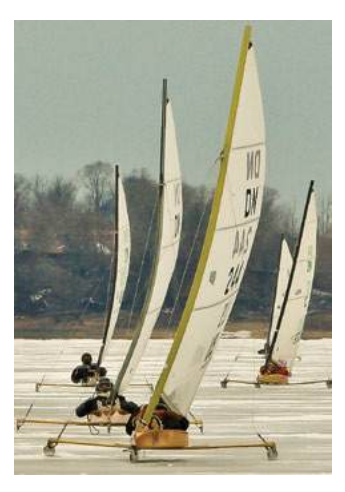
EASTERN LAKES TBD idniyra.org