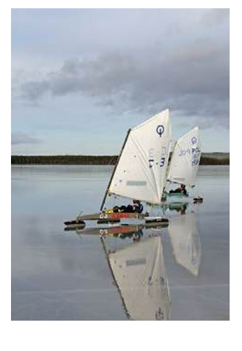
DN & ICE OPTIMIST JUNIOR WORLD CHAMPIONSHIP