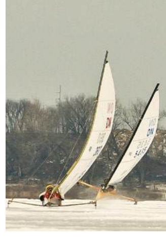
CHAMPIONSHIP February 22 - March 1, 2025 Host: Finland idniyira.eu