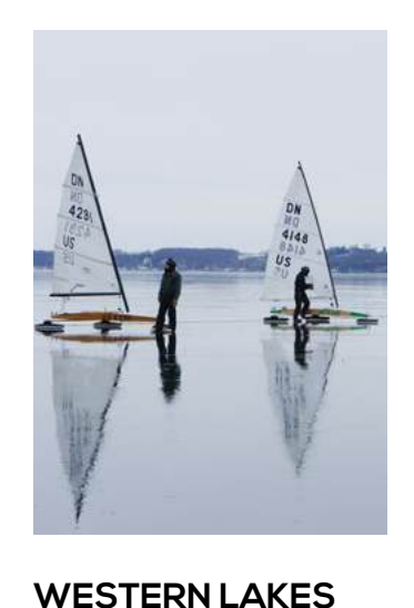
January 4-5, 2025 idniyra.org