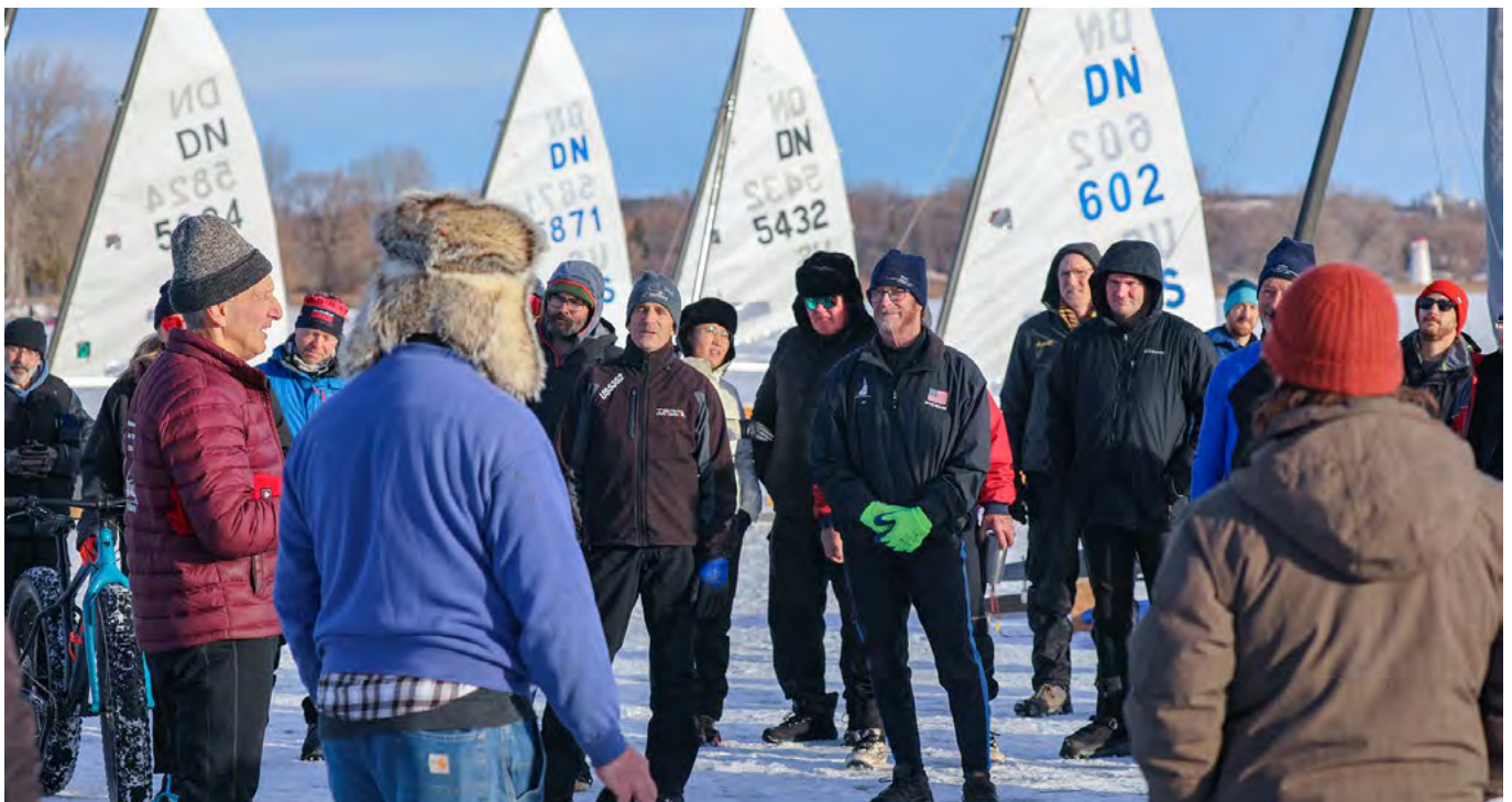
2024 Western Challenge skippers meeting.

1) No race shall be started if the wind velocity measured at the starting line 3 minutes before the start for a period of 15 seconds exceeds 20 knots. If during a race, the wind shall exceed 25 knots for a period of 15 seconds or more, that race shall be cancelled.