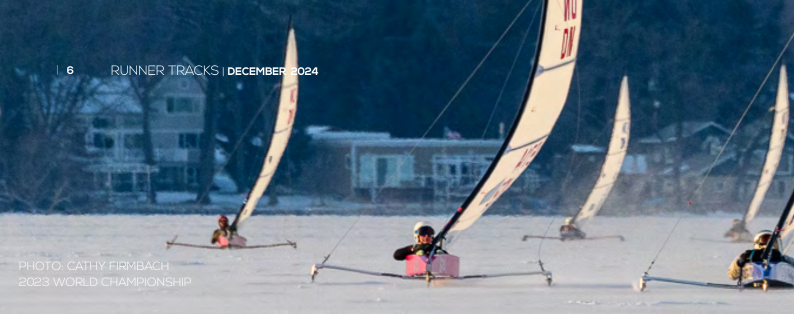
2023 WORLD CHAMPIONSHIP