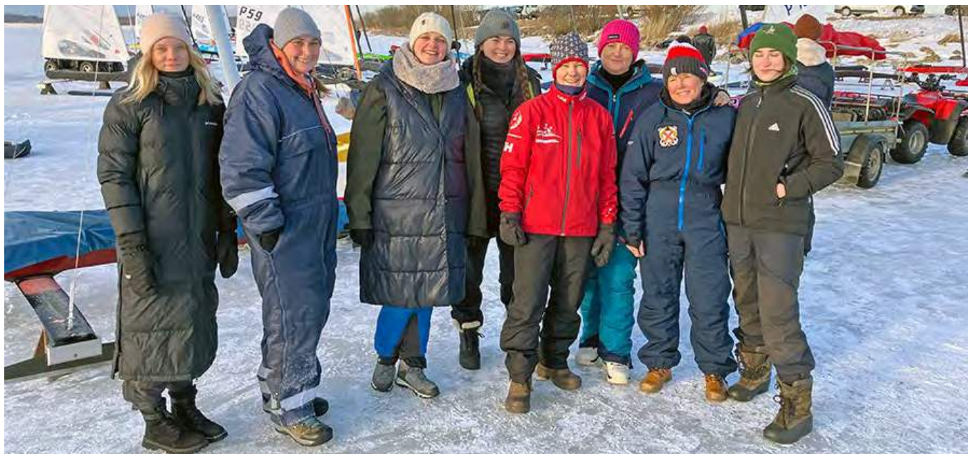
Women of the DN European Fleet

The ice was a fantastic sheet of snow ice that had been rained on. It was smooth and fast with unlimited size. We should be so lucky in North America.