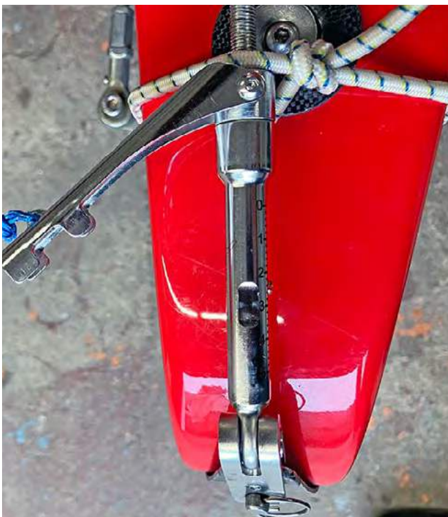
FORESTAY ADJUSTER: There was a really nice forestay adjuster on the red boat. It was expensive but nice, with numbers and its own turning mechanism so that carrying a wrench wasn't necessary.