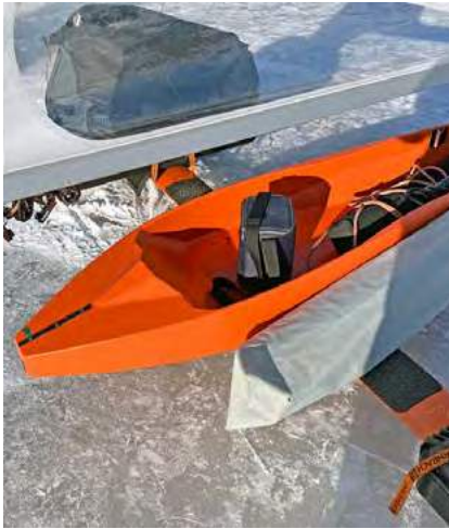
SEAT BACK: It wasn't round, but it looked kind of cool, which gave the boat a different appearance. It will take a better technical mind than mine to determine if that design is within the specifications.

ONE ASPECT OF A NO-WIND DAY IS BEING ABLE TO LOOK AROUND AND SEE WHAT OTHER SAILORS MIGHT BE DOING WITH THEIR EQUIPMENT. DN SAILORS ARE TINKERERS AND INNOVATORS, PROVIDING SOME INTERESTING THINGS TO SEE ON A WALK THROUGH THE MOORING AREA. THERE WERE SEVERAL INTERESTING INNOVATIONS - BOB CUMMINS US3433