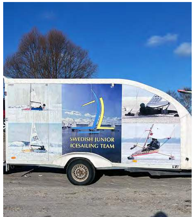
TRAILER GRAPHICS: The Swedish trailer with graphics featuring junior sailors was eye-catching.