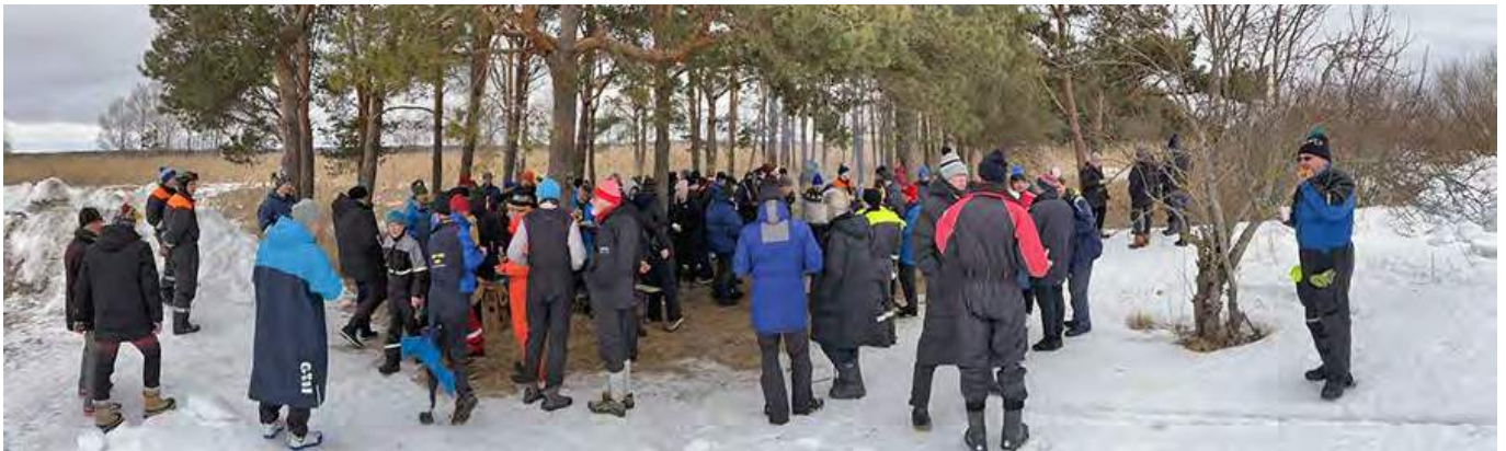
One of the post-race BBQ events sponsored by the different countries and the Ice Optimist fleet.

There was plenty of food at this World Championship. You won't be hungry for anything at a European regatta except more speed. Iceboating is a chance to see the world, and the world hopes to see you on the ice.