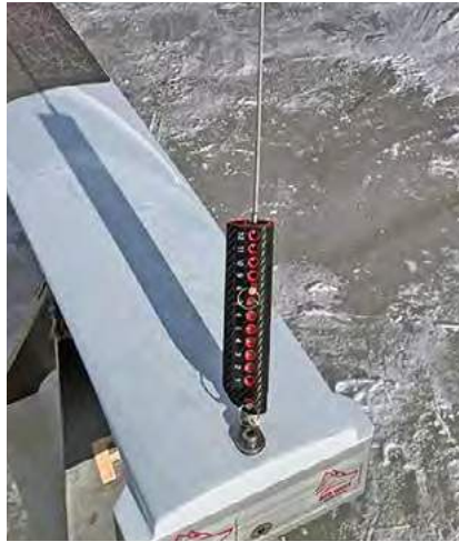
SHROUD ADJUSTER: Here's an aerodynamically shaped shroud adjuster with numbers. I suspect these are available commercially.