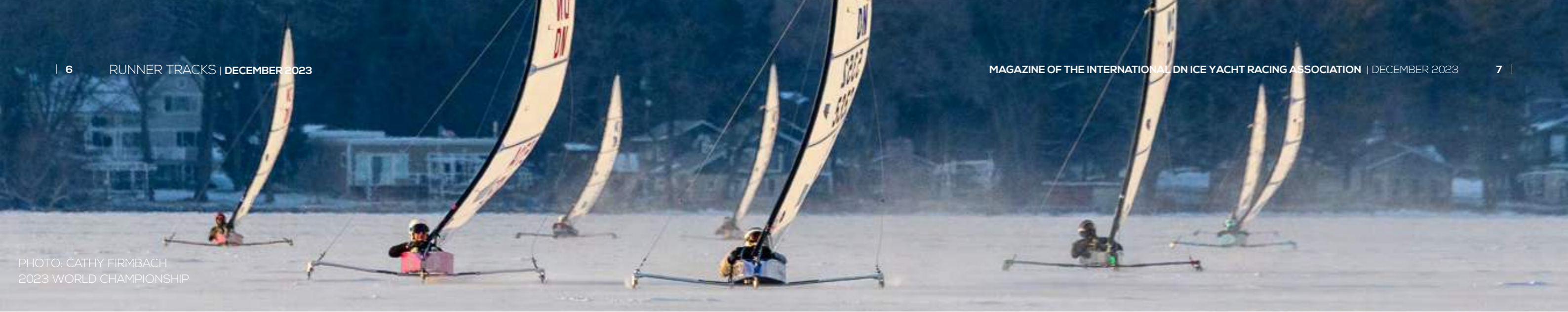
2023 WORLD CHAMPIONSHIP