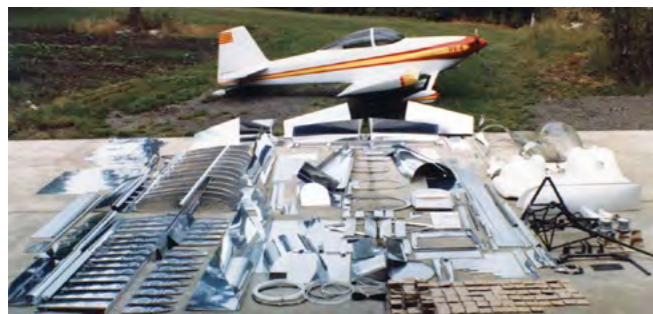
RV Aircraft Kit by the Van Company

“Kits would sell again if marketed in the right way.” First-time iceboaters would buy kits, and many would upgrade to a more customized racing boat, selling the kit boat to one of their friends.