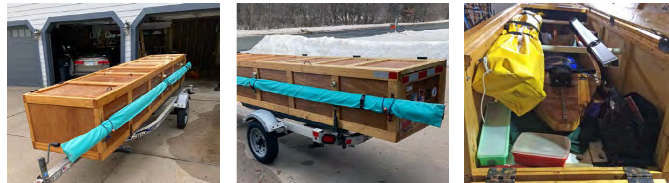
Dave Glick US4249

Next is the running gear itself. Larger tires are easier to push around in snow and over sand. Conversely, this adds weight, but if there are choices, larger tires are better, and the extra weight is generally compensated for by ease in pushing. Larger automobile-size tires may be too large. Don't buy