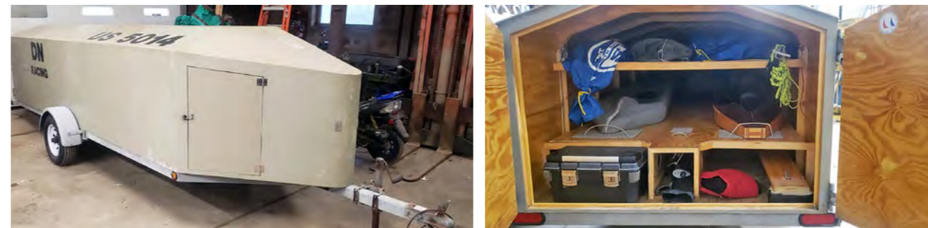
Mark Isabell US5014

and runners in the bottom side compartments. The top shelf holds booms and sails, thus keeping the center of gravity as low as possible for better towing characteristics.