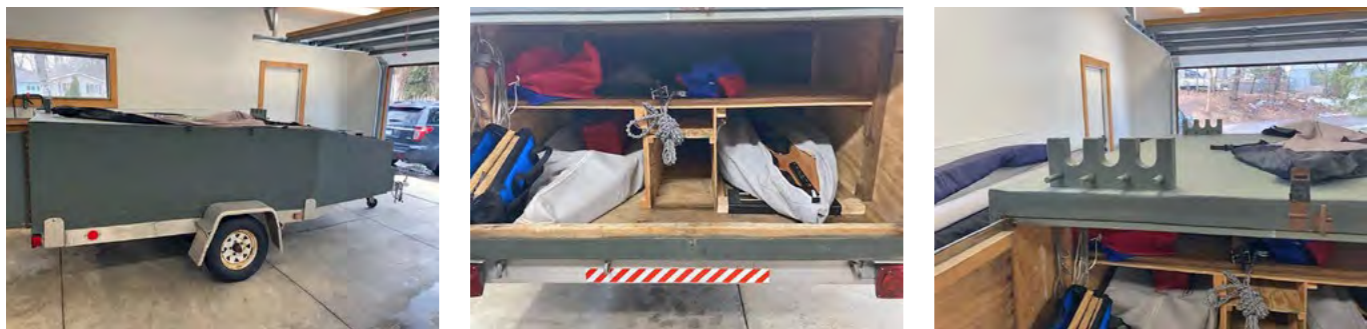
Mike Bloom US321

Mike Bloom's US321 trailer is pictured above. Again we see an aluminum frame, a low profile box, with external mast carriers on top of the box. It is also noteworthy that the box is back far enough on the frame so that the tailgate of an SUV will open while attached to the car. The forward third of the box is tapered downward and inward since that area holds nothing other than the front third of the hulls. The interior layout is simple and functional. The boats are on the bottom, not on a track, planks in the center compartment, and booms and sails on the top shelf. The boats slide in and out easily without a track, and the fit is close enough that they don't move around while traveling.