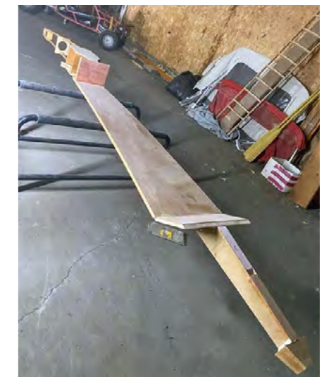
Norton DN Kit: Bulkhead, floor, nose block, and stern block.

"Quick Build Kits" were once sold by Joe Norton US781 of Norton Boatworks in Green Lake, WI. Norton Boatworks began selling DN kits after three years in business selling complete DNs.