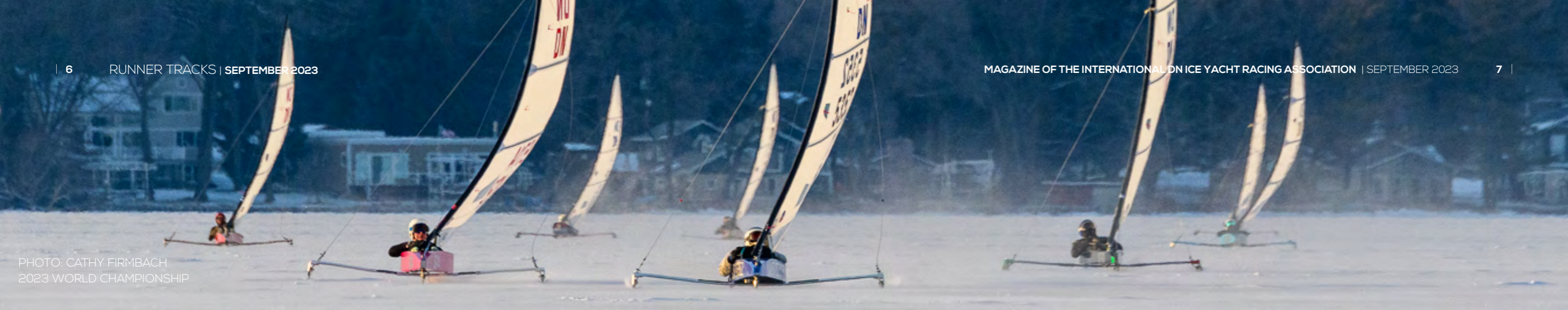
2023 WORLD CHAMPIONSHIP