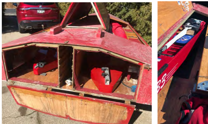
Joe Norton US781