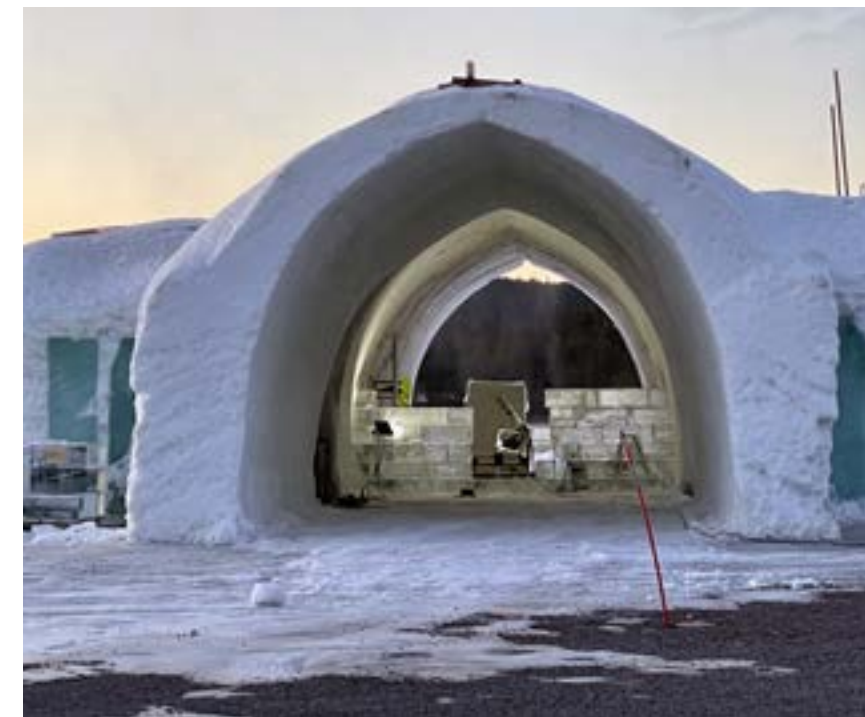
The famous Ice Hotel under construction above the Arctic Circle near Kiruna, Sweden in December 2020.

At the beginning of December, the Facebook ice skating scouts shared information about the Östersund area. At the same time, DN sailors from Östersund had their first sailing days on Lake Mosjön. At first, our focus was on Lake Annsjön, much bigger than Lake Mosjön, but the day before we decide to go, too much snow fell at Lake Annsjön. Luckily Lake Mosjön received only half a centimeter of snow, so we hit the road for a 9-hour drive to Östersund. In the meantime, Piet Ploum H472 arrived at Mosjön and checked the lake. We planned to stay here for five days. Although we don't usually want to have snow on the ice, in this case, it was good training, and we found out what setup worked for us in this kind of condition.