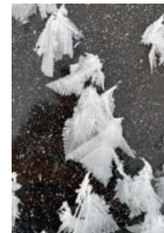
"Ice Flowers" at Orsasjön.

At the beginning of January, the Mora skating club reported 4 cm (1.5 in) of black ice on Lake Orsasjön. Another plan was born, with all our gear was still in the car, we went to Orsa, the site of the 2020 Gold Cup. Although the ice was still too thin, we decided to wait until the ice was ready. In the coming days, the prediction was -15 C (5 F) which meant that within 1 or 2 days, Orsasjön would be sailable. When we arrived, the ice was already grown to 7 cm (2.75 in), and