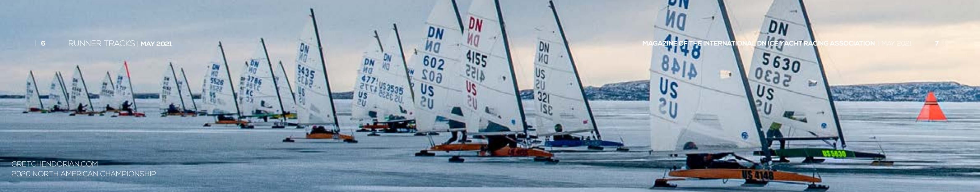
GRETCHENDORIAN.COM 2020 NORTH AMERICAN CHAMPIONSHIP