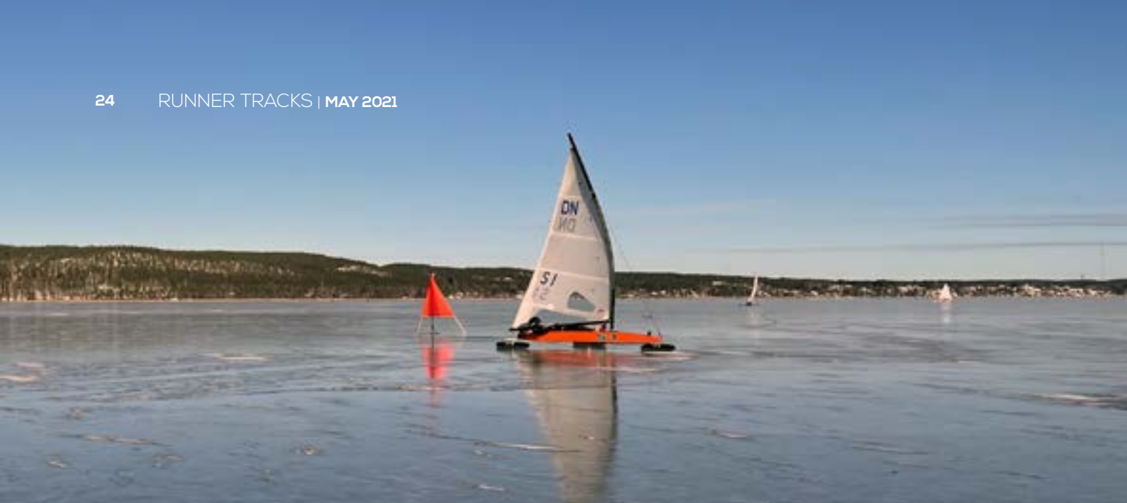
David Croner S1 rounds the mark.

It was a nice relaxing sailing day with perfect weather and 4 meters per second (9 miles per hour) of wind, although the ice was quite rough.