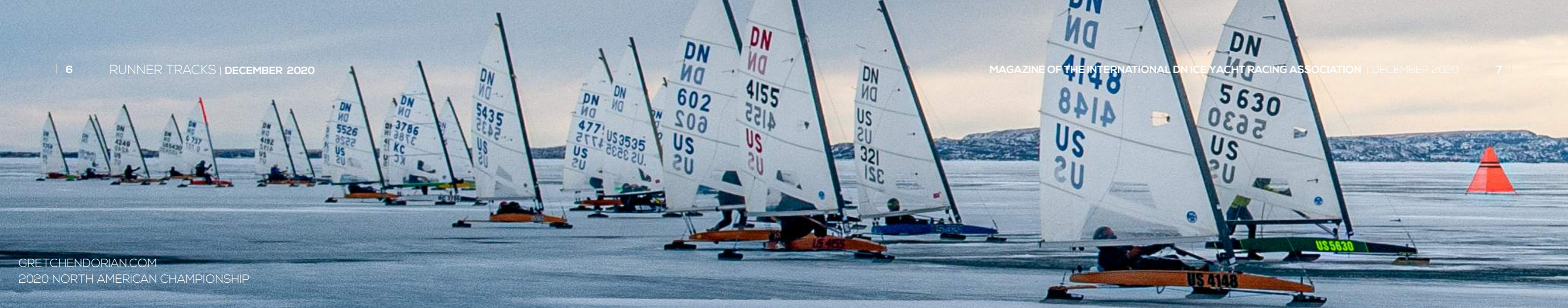
GRETCHENDORIAN.COM 2020 NORTH AMERICAN CHAMPIONSHIP