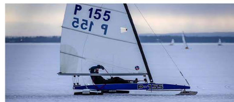
The 2020 DN World Champion Mast

MASTS HULLS RUNNERS SAILS PLANKS THE COMPLETE DN - CUSTOM MADE FOR YOU