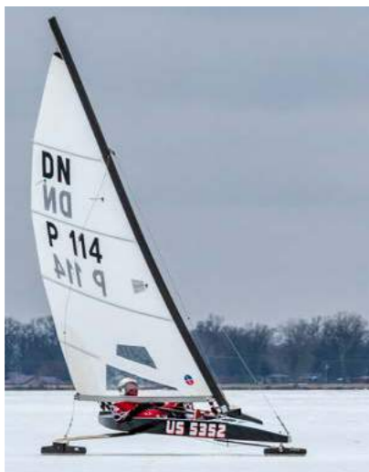
Winning the 2019 Gold Cup in a borrowed boat.

Scorers and Race Committee personnel do not use these hull identification graphics very often for lap management, scoring or collision assessment as originally intended. Also as we saw at the 2019 GC Rule A30 currently makes lending equipment to sailors more difficult with possible SI amendments needed from the OA. The proposed number sizing is 'recommended' so that variances in size of optional numbers would not be subject to protest.