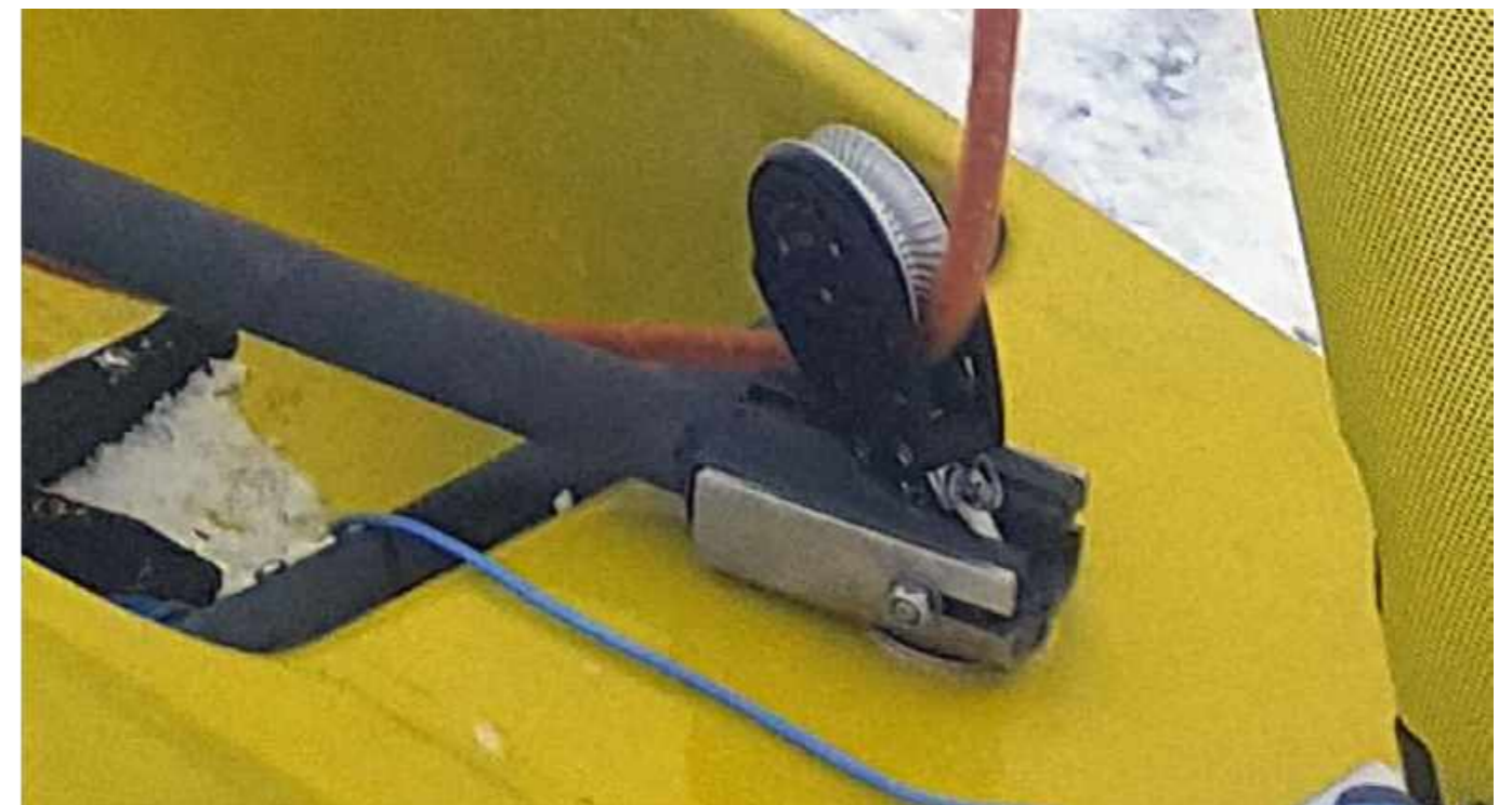
Question 4: New I. Fittings 18. Steering Post Head