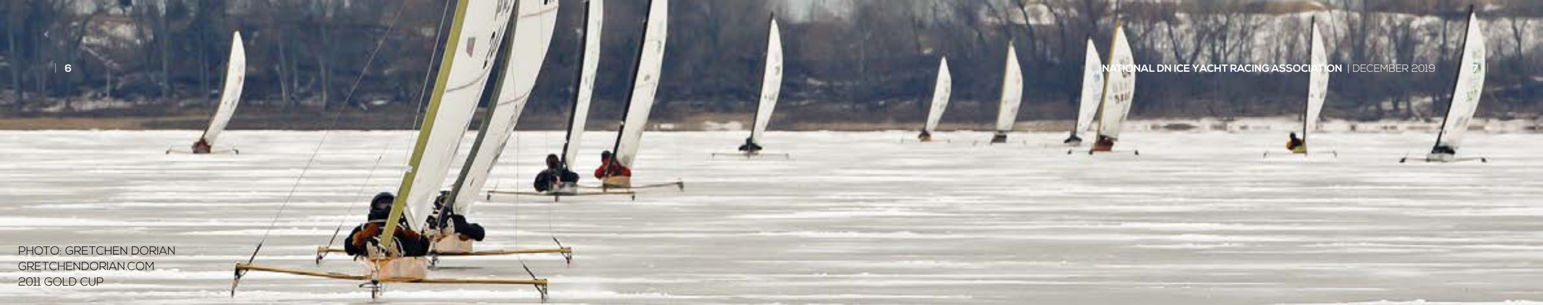
2011 GOLD CUP