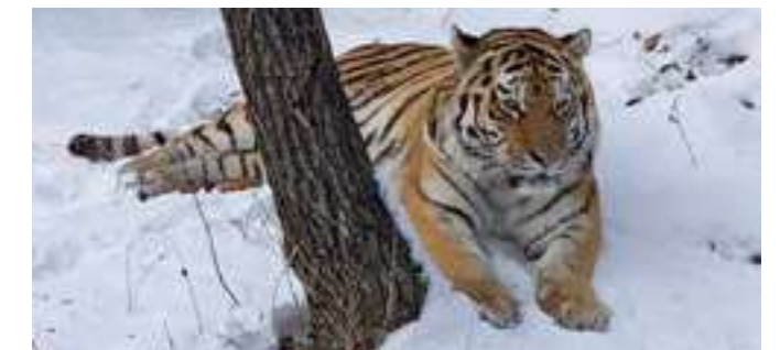
An Amur tiger.

reserve. Amur tigers are the biggest in the world and are indigenous to the area around Vladivostok. There are estimated to be 300 wild Amur tigers living around Vladivostok. We also discovered jazz clubs that we all enjoyed.